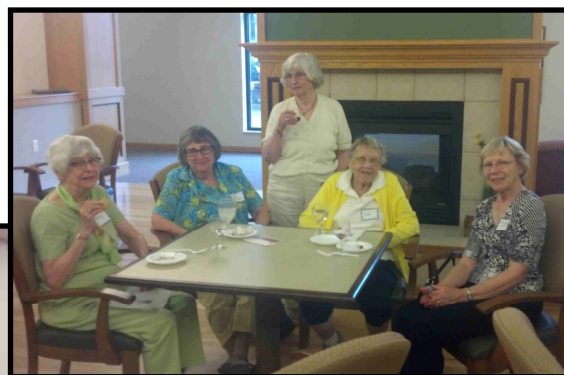
Another successful neighborhood gathering!