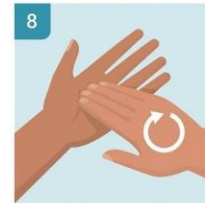
WASH FINGERNAILS AND FINGERTIPS