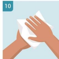
DRY WITH A SINGLE USE TOWEL