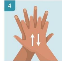
LATHER THE BACKS OF YOUR HANDS