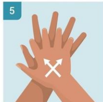
SCRUB BETWEEN YOUR FINGERS