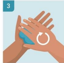
RUB HANDS PALM TO PALM