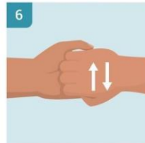
RUB THE BACKS OF FINGERS ON THE OPPOSING PALMS