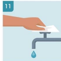
USE THE TOWEL TO TURN OFF THE FAUCET